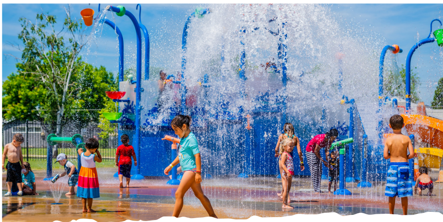
The White Rock Splash Park is not included in the rental of the Clubhouse.