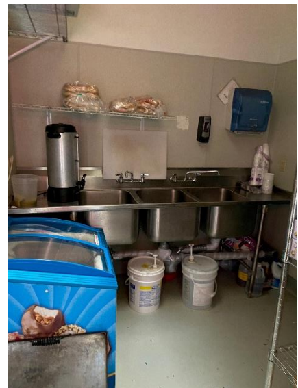
Snack Bar Interior