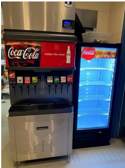
Snack Bar Interior