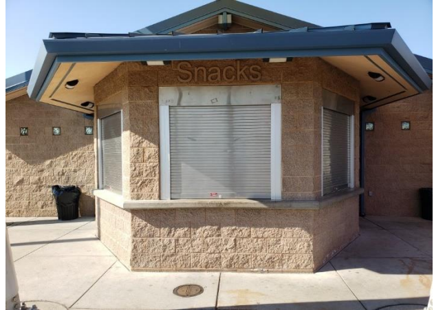
Front of Snack Bar