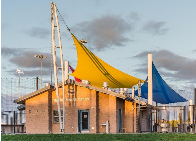
Front of the Mather Sports Complex