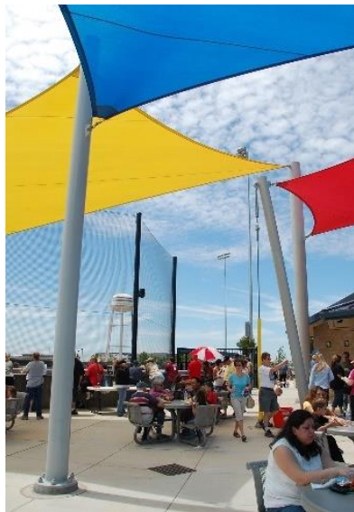
Outdoor Seating Area