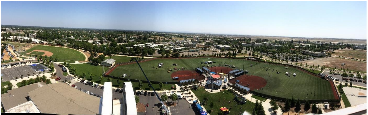
Mather Sports Complex Aerial View