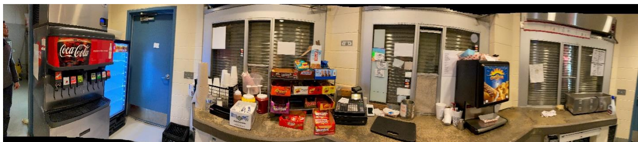
Snack Bar Interior