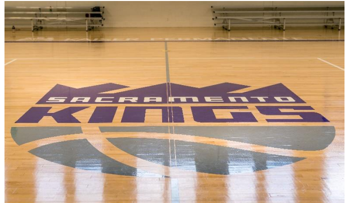
Newly Renovated Gymnasium